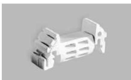
64612013-00 DIN Rail adapter