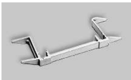
60362121-00 Jumper guide