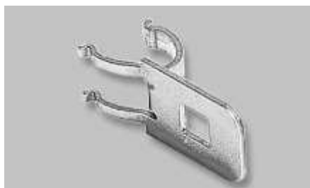
60893202-00 Earthing contact clip