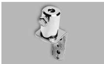
66192026-00 Earthing clamp