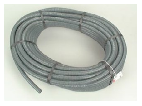
FIST-GS-FLEX-7-50 - FIST-GS-FLEX-10-50